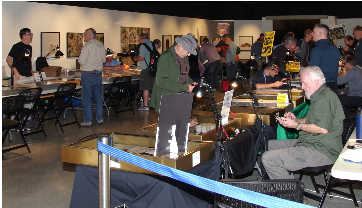
Dealers and customers interact during the Carson City Mint Coin Show at the Nevada State Museum on September 20, 2024.