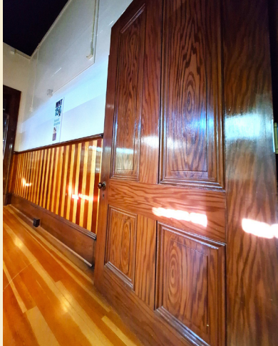
Wainscoting and hand painted oak graining on wood door inside the Mint building.