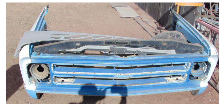
from top above: Disassembled parts of the truck ready for restoration.